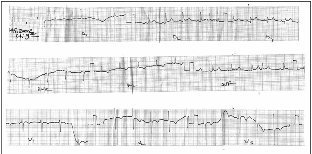
Figure 1. ST elevation on D 2,3, AVF at 9 AM.

Headache, dizziness, and fatigue were the most common adverse events occurring in clinical trials. Valsartan attenuated the hydrochlorothiazide-associated decrease in serum potassium concentrations; hypokalemia occurred in 4.5% of valsartan plus hydrochlorothiazide recipients. 7